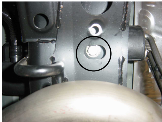
Underside – Rear of Vehicle to right of image