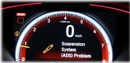
Error is detected at removal of a stock damper.