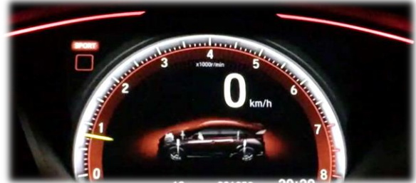
With SEC, error is NOT detected at removal of a stock damper.