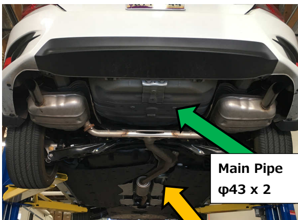
Stock Exhaust System

Without uncomfortable exhaust resonance, the sporty exhaust sound and comfortable interior space are created.